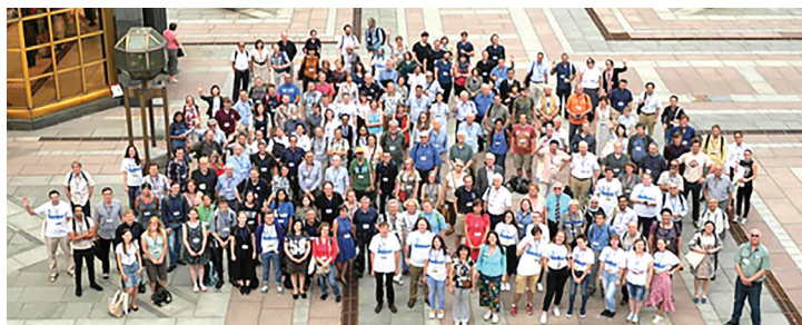
The MetSoc 2018 conference group photo.

The 81 st Annual Meeting of the Meteoritical Society (MetSoc) was held 22–27 July 2018 in Moscow (Russia). The conference was hosted in the Presidium of the Russian Academy of Sciences building, also called the “Golden Brains”. Some 302 participants from 28 different countries registered for the meeting, including 213 professionals (scientists plus exhibitors), 71 student participants, and 18 guests. A total of 164 registrants were MetSoc members. The MetSoc exhibition area also played host to the booths of publisher Springer, the journal Nature , and the analytical manufacturers of CAMECA and Textronica. In total, 358 abstracts were accepted for 204 oral and 154 poster presentations. Oral presentations were scheduled in three parallel sessions from Monday (22 July) to Friday (27 July), and all posters were on display for the entire duration of the conference.