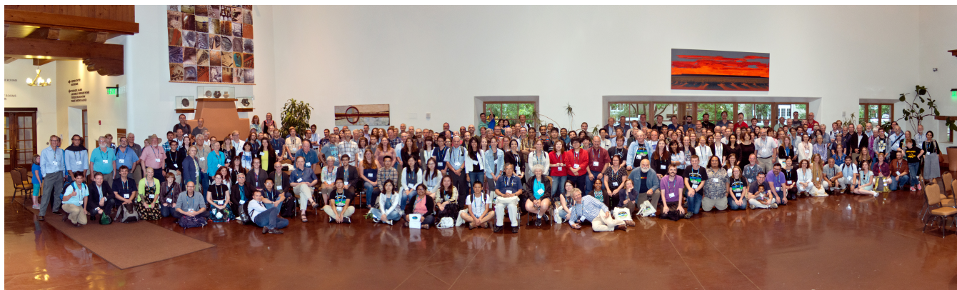
Group photo at the 80 th Annual Meeting in Santa Fe.