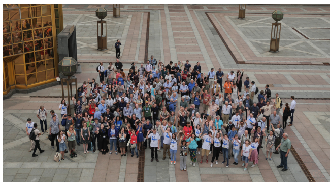
Group photo at the 81 st Annual Meeting of the Meteoritical Society

The 81 th Annual Meeting of the Meteoritical Society was held on July 22–27, 2018 in Moscow, Russia. The conference was hosted in the Presidium building of the Russian Academy of Sciences, a well-known and distinguished conference venue with unique Futurist architecture. 302 participants from 28 different countries registered for the meeting including 213 professionals (scientists and exhibitors), 71