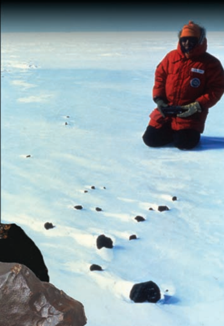
Meteorites in Antarctica