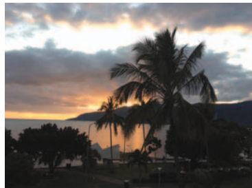
Sunrise over the Cairns harbor